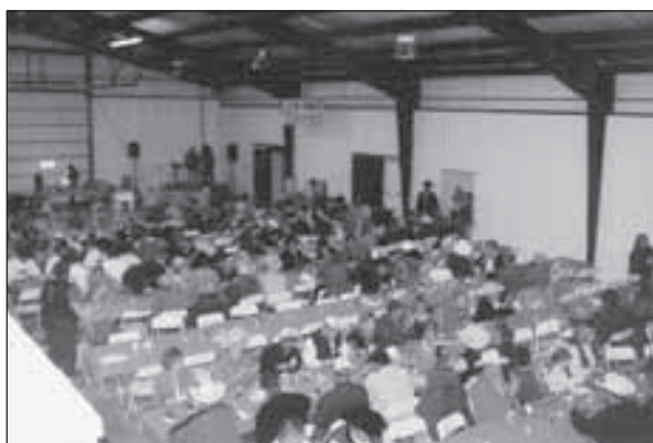
Inside our sale barn on the 2003 Montana Angus Tour

A featured AI sire from Connealy's. Good growth and carcass. 102 and 104 on his calves. One daughter and eight sons sell.